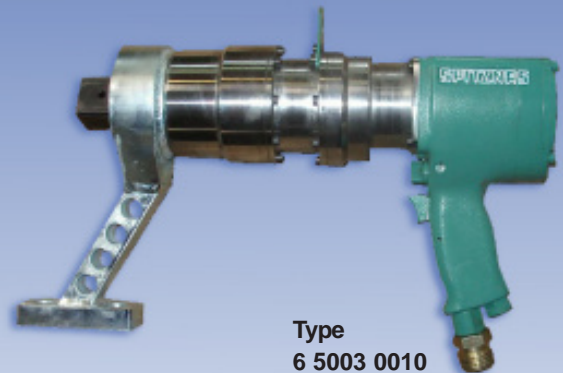
Type 6 5003 0010