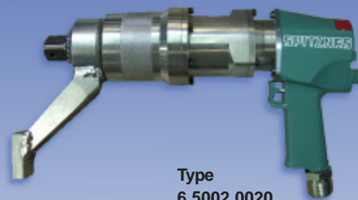
Type 6 5002 0020